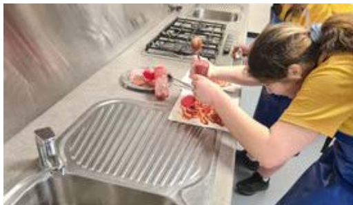
Year 9 Design and Technology - Designing different bedroom lights