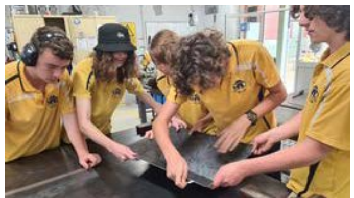
Year 10 Engineering - Using arduinos to program robotic arms