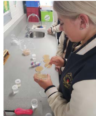
Year 12 Biology students working on their depth studies