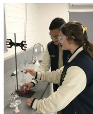
Year 12 Chemistry students doing titration experiments