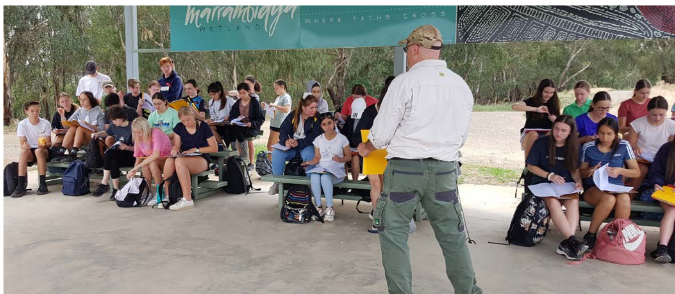
Year 11 Biology and Investigating Science students doing field work at Marrambidya Wetlands