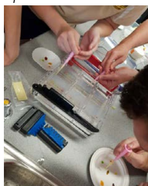
Year 12 Biology students setting up gel electrophoresis