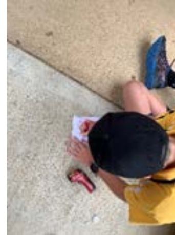
Year 9 Geography undertaking Geography field work