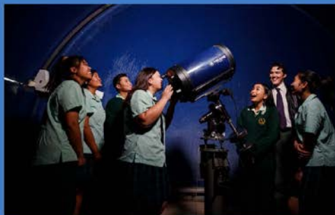
The Selective High Schools placement process for Year 7 entry is administered by the High Performing Students Team. It is referred to as 'the Team' in this document.

https://education.nsw.gov.au/public-schools/selective-high-schools-and-opportunity-classes/year-7