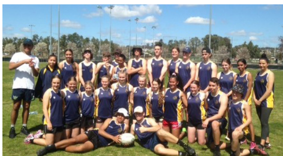
Our Senior & Junior Touch Football teams