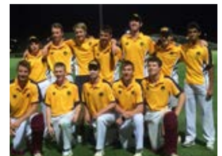
2016 Byrnes Cricket Shield Team Runners-Up