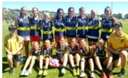
Years 7-9 League Tag Girls playing on Tuesday 22nd March. Girls had a fun day learning the game and participating in the day.