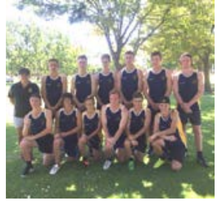
Year 9/10 Touch Football Grand Finalists at the All Schools Touch Football Gala Day