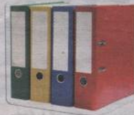
Paper-based Learning Materials