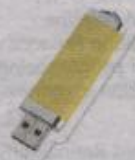
USB Flash Drives

The Australian Government is helping with the cost of educating your kids.