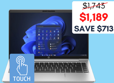
HP ProBook 445 G11 14" AMD Ryzen 5 + 3yr Onsite Support 16GB RAM / 256GB Storage Touchscreen