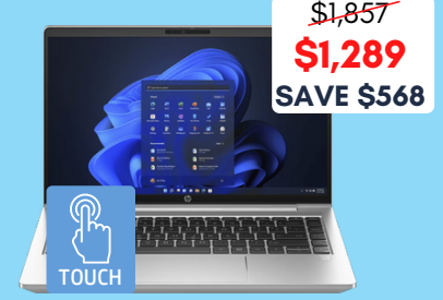
HP ProBook 440 G11 14" Intel Core Ultra5 + 3yr Onsite Support 16GB RAM / 256GB Storage Touchscreen