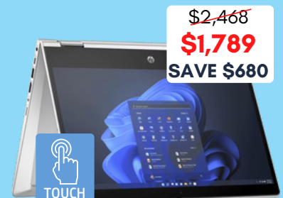
HP ProBook 435 x360 G10 13.3" AMD Ryzen 7 + 3yr Onsite Support 16GB RAM / 512 GB Storage Touchscreen + Pen