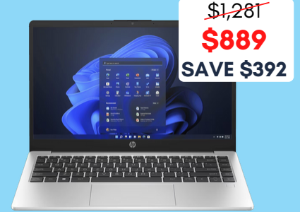
HP 245 G10 14" AMD Ryzen 3 + 3yr Onsite Support 8GB RAM / 256GB Storage