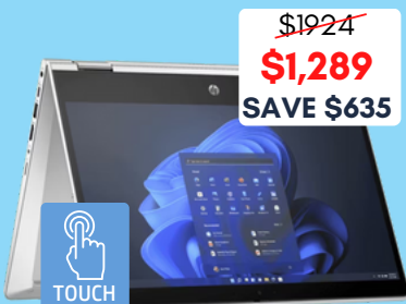
HP ProBook 435 x360 G10 13.3" AMD Ryzen 3 + 3yr Onsite Support 16GB RAM / 256 GB Storage Touchscreen + Pen