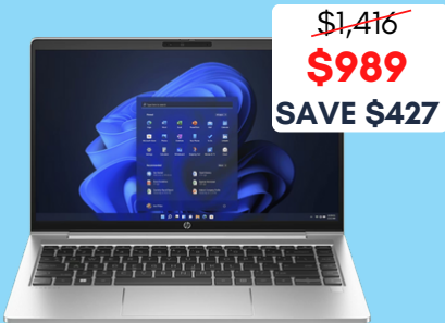
HP 245 G10 14" AMD Ryzen 5 + 3yr Onsite Support 8GB RAM / 256GB Storage