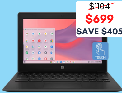
HP Fortis II G10 Chromebook 11.6" N200 + 3yr Onsite Support 8GB RAM / 64eMMC Storage Touchscreen