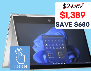
HP ProBook 435 x360 G10 13.3" AMD Ryzen 5 + 3yr Onsite Support 16GB RAM / 256 GB Storage Touchscreen + Pen