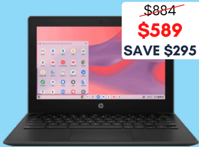
HP Fortis II G10 Chromebook 11.6" N100 + 3yr Onsite Support 4GB RAM / 32eMMC Storage

Purchased separately after 4 day mandatory cooling off period, please see back of flyer for more details.